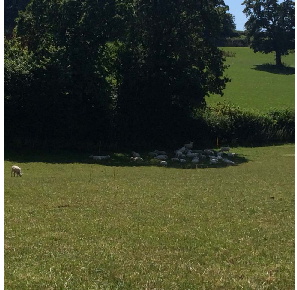
Organic Research Council Presentation 2016 “Sheep and Trees”